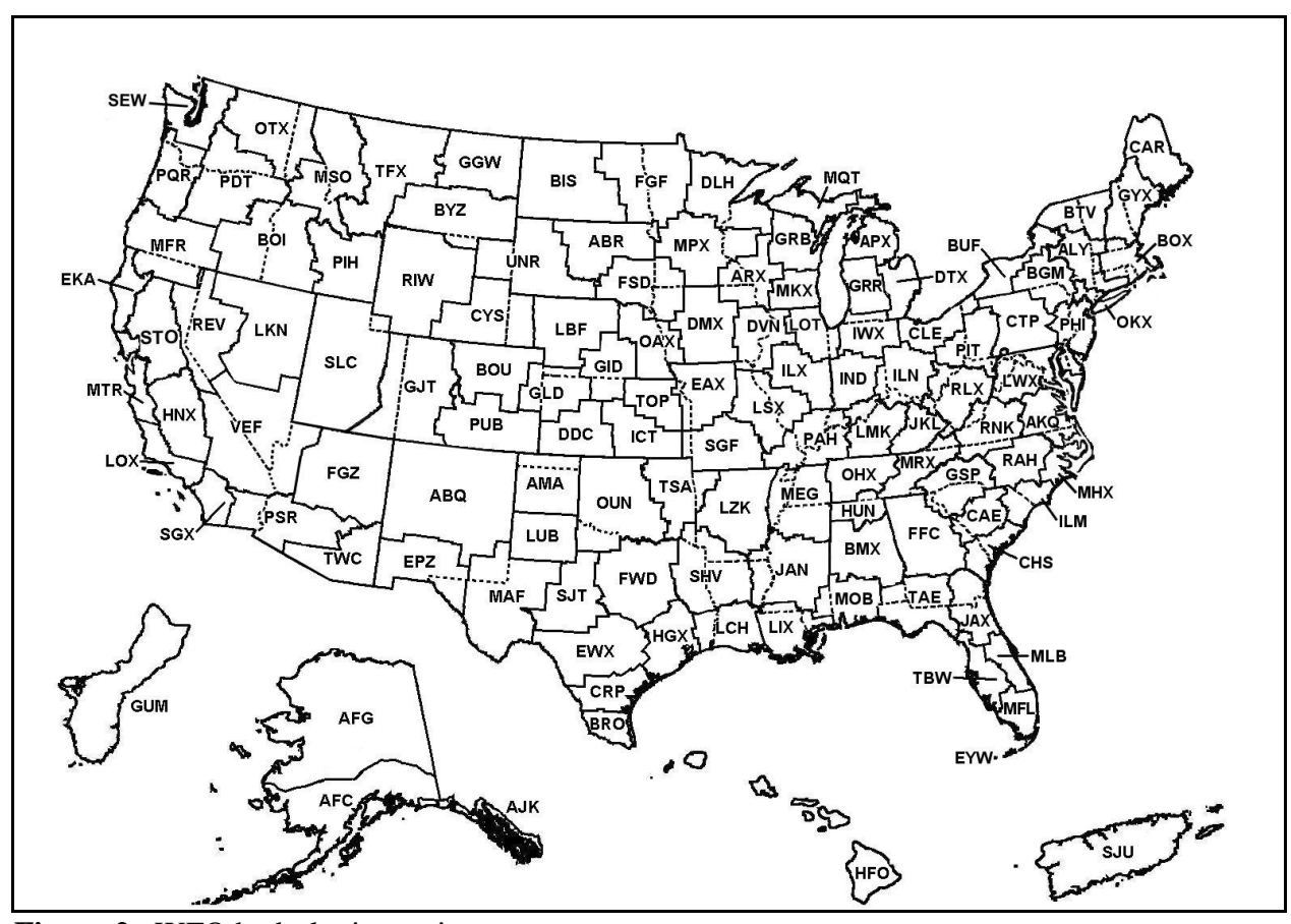
Figure 2. WFO hydrologic service areas.

Detailed HSA definitions, maps, and descriptions of WFO hydrology program support responsibilities are contained in supplements to this directive issued by the NWS regions. When an HSA boundary needs to be adjusted between two or more WFOs, the offices first conduct the required coordination and notification process with regional headquarters and the OPR for this directive. When an HSA boundary change is to take effect, WFOs work with the GIS focal point in the Systems Engineering Center of the OST to modify the shapefile used to generate the national HSA map. The national HSA map can be found in the AWIPS Map Database Catalog at <a href="http://weather.gov/geodata">http://weather.gov/geodata</a>. A national HSA map is shown in Figure 2.