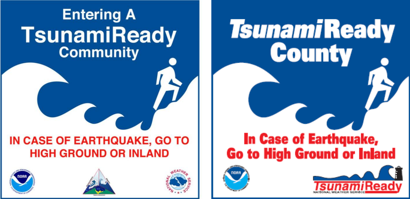
Left: NWS TsunamiReady Community sign; Right, NWS TsunamiReady County sign.